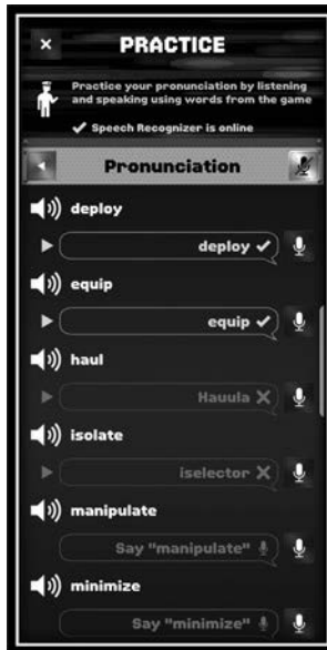
Figure 3. Spaceteam ESL: Practice.